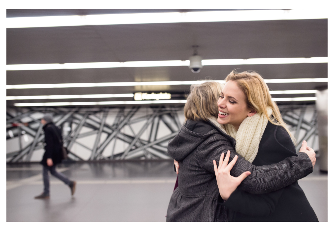
29. Let your friends and family know that you're moving

Have you told your friends and family that you're moving? It's okay if you haven't had the time to inform everyone. Now that you've finished all the preparations for the move, call up or write to your friends and family to let them know that you're moving.